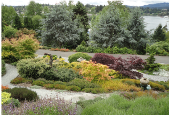
A view from the path, looking down onto the Three Islands and Lentz Garden, in Albers Vista Gardens

Professor Albers started by laying a path of granite stepping stones to create distinct garden areas. He planted conifers in key locations to give the garden structure, then gradually integrated other plants by their characteristics and suitability for each area. More than 1,200 native species and cultivars now fill the garden, including a collection of 350 conifer cultivars such as Japanese cedars, dwarf conifers, and the rare Abies nebrodensis 'Sicilian Gold' (Sicilian fir).