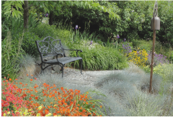
Benches along the paths at Albers Vista Gardens offer resting places with views of the Port Washington Narrows